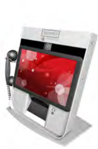
enGAGE C-Series 19" or 22"

No matter what your directory or way finding need is, RedyRef has an enclosure solution that will meet all of your requirements. We offer a variety of form factors that can be tailored to your brand and guest needs, including various screen sizes and configurations.