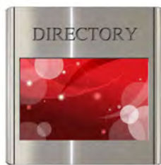
X9-H 22", 32", 42"