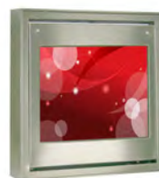
Matrix 19", 22", 32", 42"