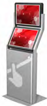
enGAGE L-Series 22" or 24"