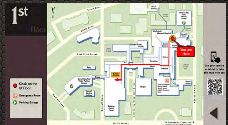
Animated paths with QR Code to launch map on multimedia