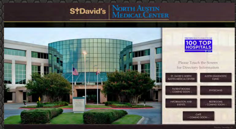
Customizable search buttons and image