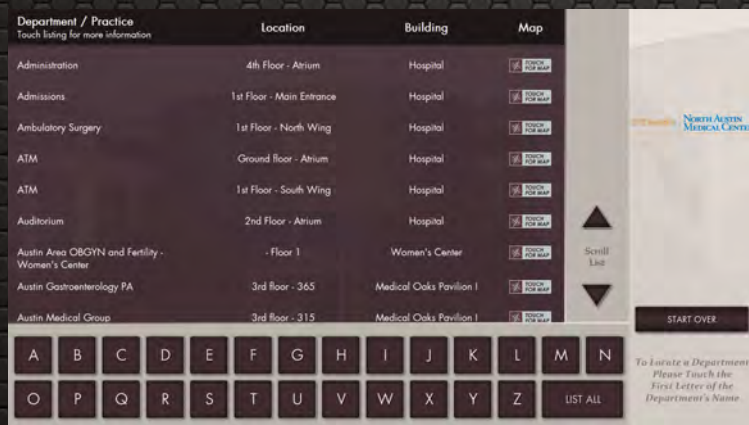
Search, listing and scrolling integrated into one page