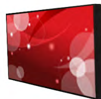
TK-Expo 19", 22", 32", 42" 55", 70"