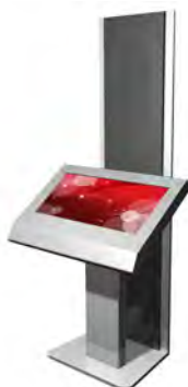
Empire 32" or 42"