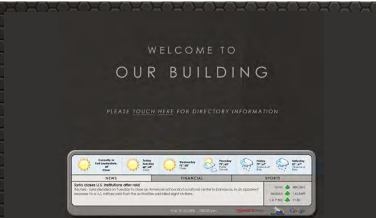
Attract screen can be customized with building name and image

RedyRef's interface software solutions are tailored to meet your guests' way finding needs. We design a holistic solution that guides guests from splash page to directory and then through the wayfinding process, all in a simple and effective manner.