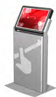
enGAGE L-Series 22", 24", 32"