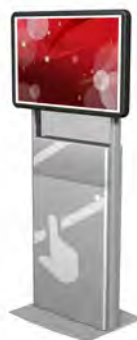
enGAGE H-Series (landscape) 22", 32", 42" 55", 70"