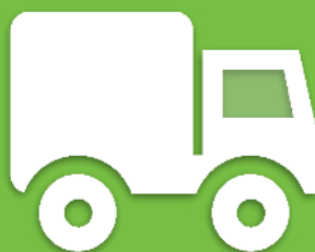
STAGING + DEPLOYMENT