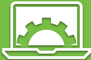
DESIGN + ENGINEERING

Vertically integrated organizations own the entire process, from concept to completion, therefore they have total control over the products that leave their facility. Not only can vertically integrated companies ensure that all aspects of their product—from the smallest components to the final product—are of acceptable quality standards, but they can also deliver final products in shorter time frames and for lower costs than those who source different aspects of the manufacturing process from outside entities.