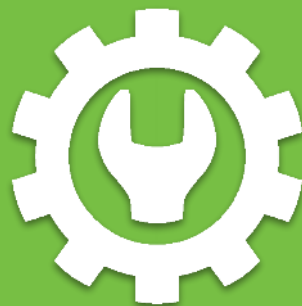
ASSEMBLY + INTEGRATION