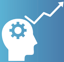
Business Outcome Planning