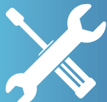
Maintenance, Support & Service

While some organizations simply deploy kiosks wherever it’s most convenient, Olea looks at placement as an opportunity for the brand to create a memorable customer experience.