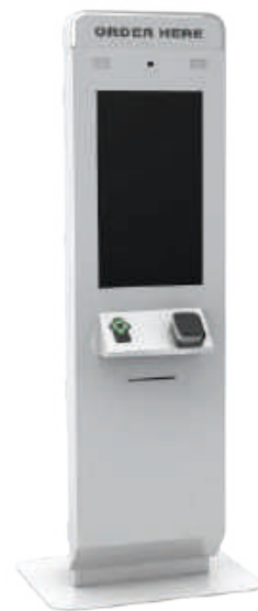
Geneva Indoor and Outdoor